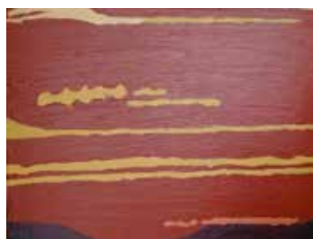
"Whale Beach Red Dawn No. 3" Original artwork by Dr Kerry Atkinson

Kerry: The advantage of this to the recipient is that engraftment of the donor stem cells is much more rapid because of the increased number of marrow stem cells collected. The advantage to the donor is that there is no need for a general anaesthetic and they do not have the postoperative pain which results from multiple needle